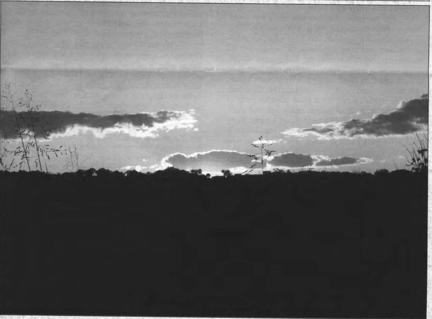
At the trail's end at Oxbow Lake Overlook on Sunday evening of the Great Outdoor weekend, the setting sun nestles down behind the bluffs supporting the city of Greendale. Lori Smith captured this wonderful sunset, proving once again that not only the animals and plants in the Oxbow are amazing but the scenery is too.