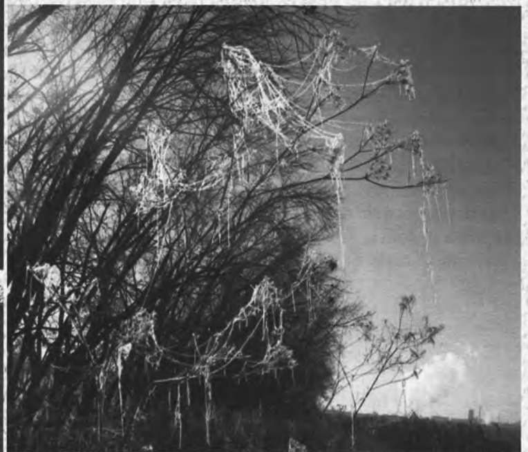
The heavy fog and low temperature on Dec 13th made for the unusual condition of a hoar frost that was still visible for about an hour after the fog lifted. The spider webs and tips of grass blend together in the frost to create an icy brush.