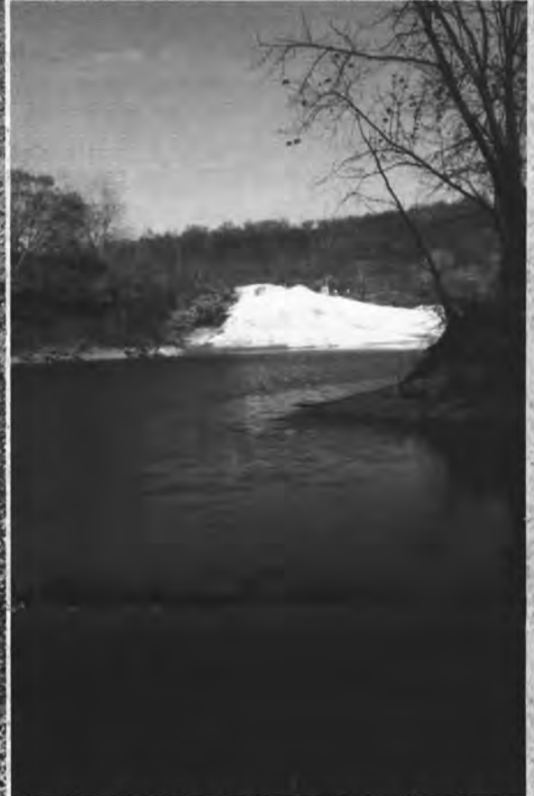
A view of the concrete "waterfall" created by the previous owner as seen from the corner of the Oxbow, Inc. property and the Best Way property.

While searching for butterflies, the census group found something much larger working the shallows of Osprey Lake. This Avocet is normally a resident west of the Mississippi River. They show up in the Midwest on occasion and Oxbow is often a place that looks like home.